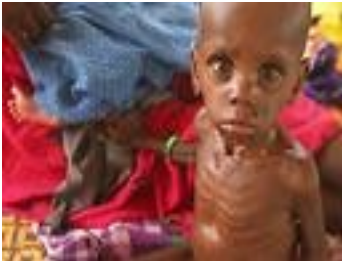
A child thin as a rail from malnutrition and suffering from starvation in Darfur.